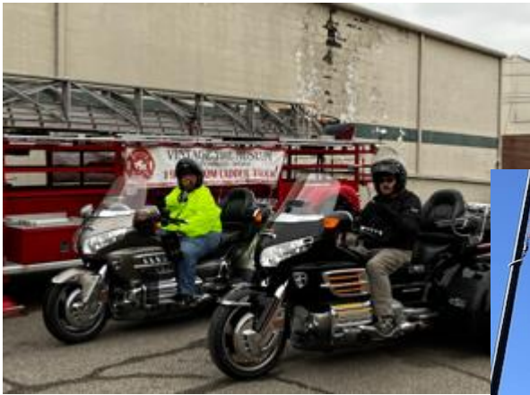
VINTAGE FIRE MUSEUM, 706 SPRING STREET, JEFFERSONVILLE IN 41730

your bike. The deadline for this pic will be May's meeting. Don't forget the goal is to reproduce the challenge pic as closely as possible using your bike in place of ours to be entered in the monthly drawing to win a $10 Rooster's gift card.