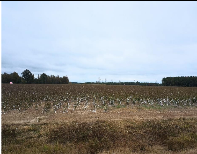
(Cotton Field) Dothan AL