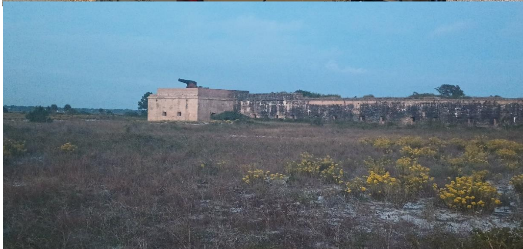
Fort Pickens Pensacola FL