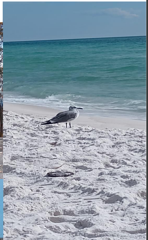
Lagoon Beach FL