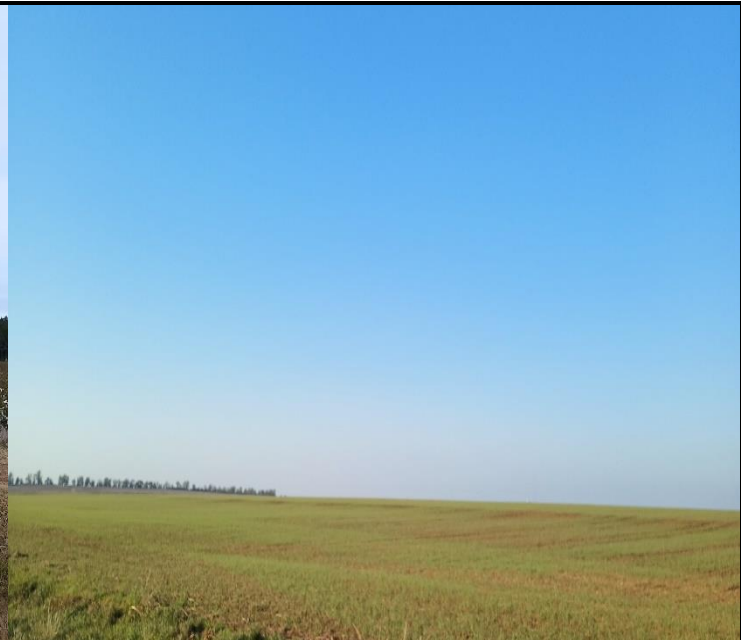
Wellington KS (Stuck Hazard Light)