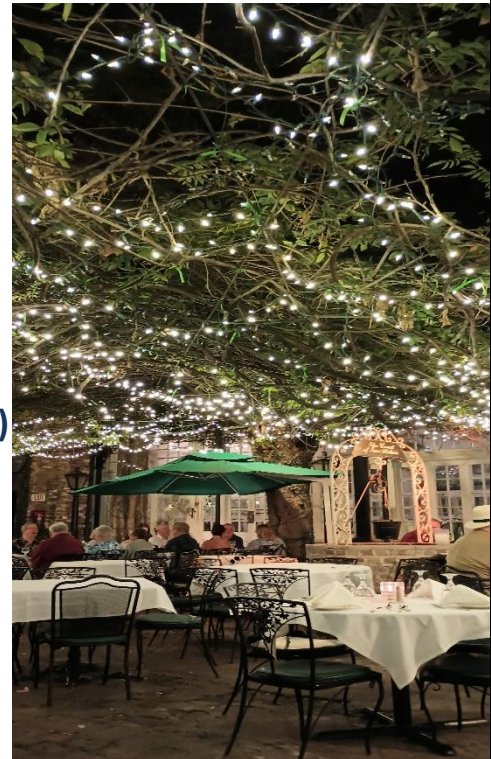
(Court of Two Sisters) New Orleans LA

We can't wait to see you at the next gathering!