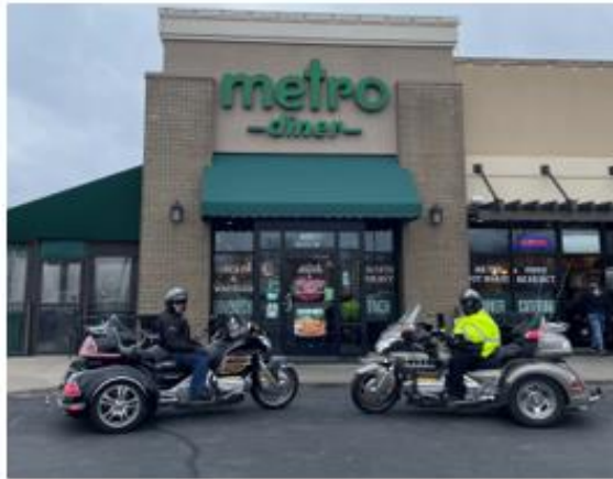
Metro Diner 4901 Outer Loop Louisville, Ky 40219

Because of the limited riding weather during the months of January and February those two monthly Copy Cat challenge photos can be taken using any vehicle and not just your motorcycles. Here's January's Challenge which will be due by our February meeting: